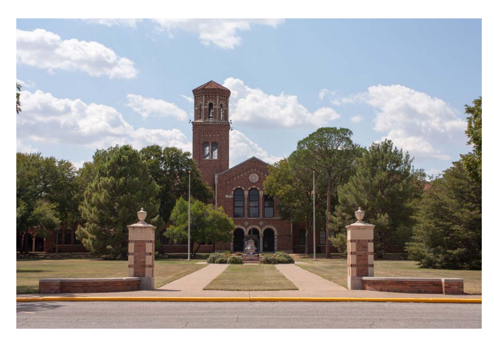
The Harding Administration Building