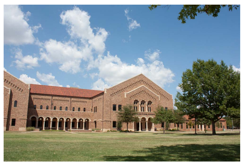
Dillard College of Business Administration