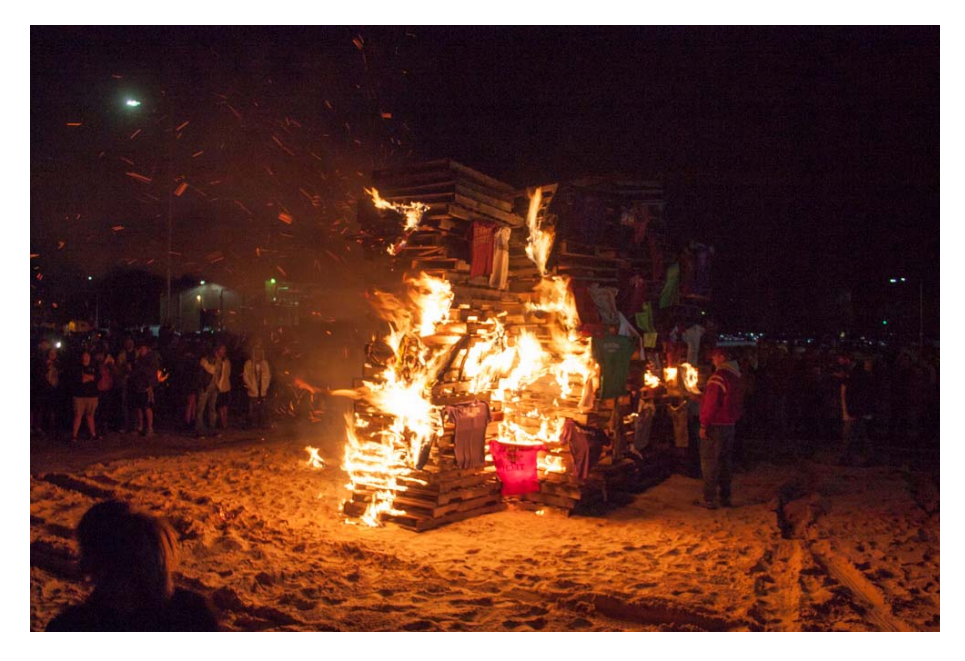
Traditional bonfire at MSU