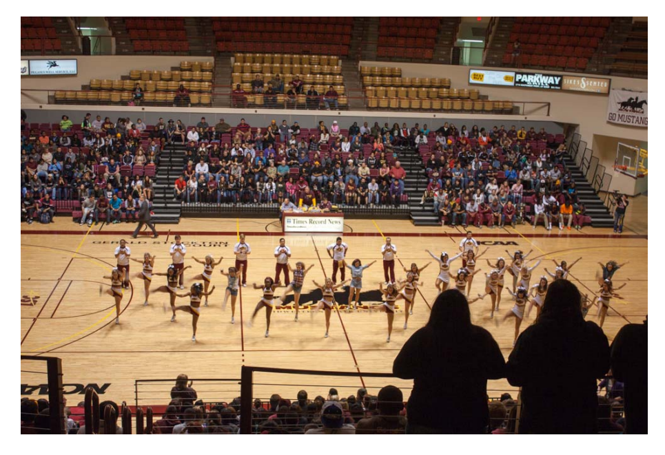
The Chearleaders at basketball-arena