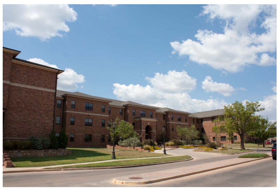
Sundance Court - Student housing